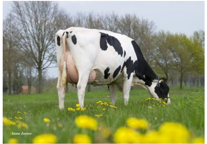
De Oosterhof DG Rubellia RDC VG-86

GP-84 Argo x VG-86 Rubicon x Aikman RDC x VG-88 Planet x EX-92 Mr Burns RC x VG-89 Shottle x EX-91 Starleader x EX-90 Prelude x EX-94 Tony