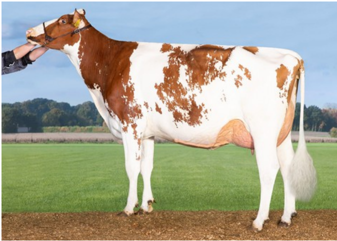
De Oosterhof DG Agrorio GP-84