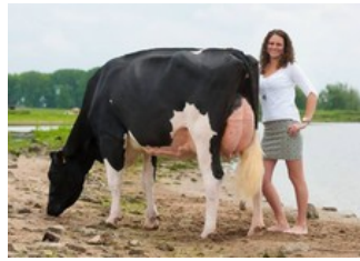
VanHolland Rochelle VG-88