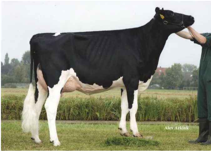
VanHolland Rochelle VG-88