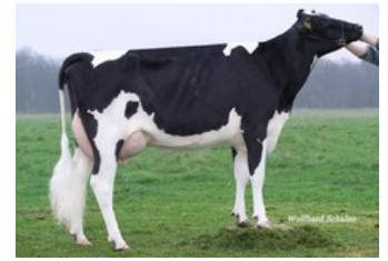
WEH Janne VG-86