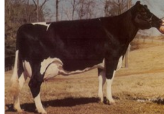
Rilara Mars Las Ravenna EX-91