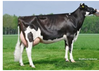
WEH Bronco Jill, Bronco x Janne VG-