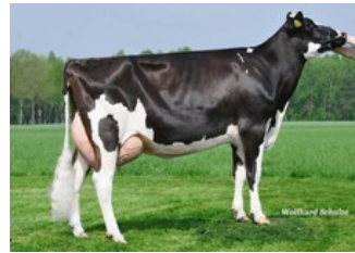
WEH Bronco Jill, Bronco x Janne VG-