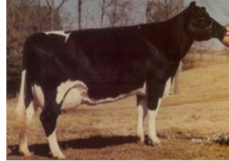
Rilara Mars Las Ravenna EX-91