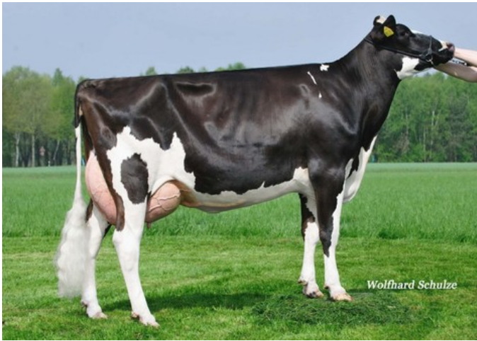
WEH Bronco Jill, Bronco x Janne VG-86