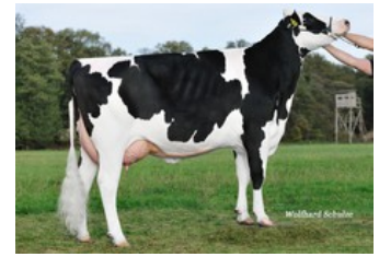
WEH Bronco Janet VG-85