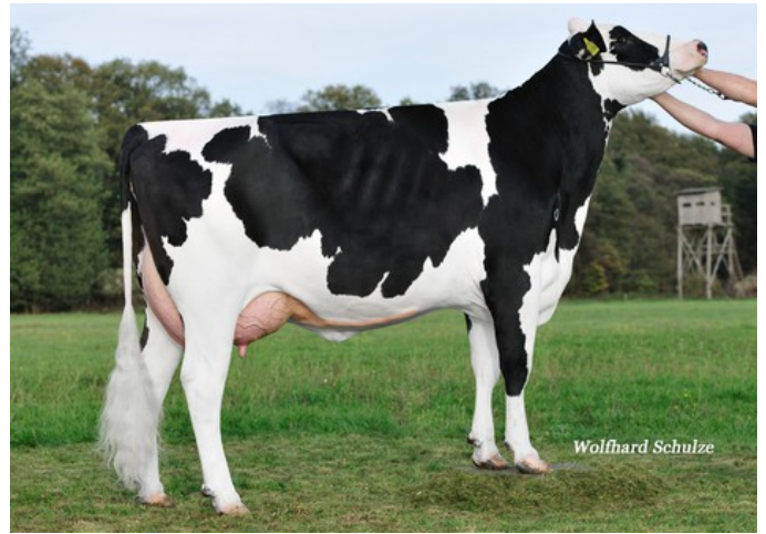
WEH Bronco Janet VG-85

GP-81 King Royal x VG-86 Silver x VG-86 Supersire x VG-85 Bronco x VG-86 Jefferson x VG-88 Laudan x VG-87 Convincer x EX-90 Airliner x GP-84 Mountain x VG-86 Melwood