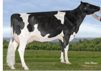
Gen-I-Beq Bolton Silence VG-85