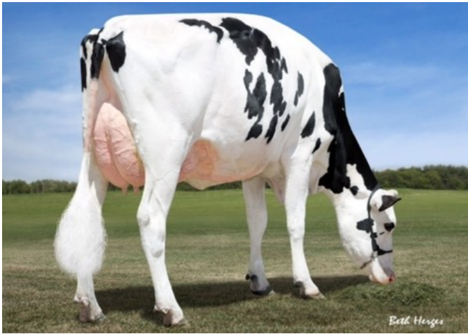
Dymentholm Sunview Sunday VG-87