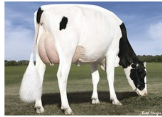
Des-Y-Gen Planet Silk EX-90