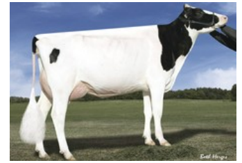
Des-Y-Gen Planet Silk EX-90