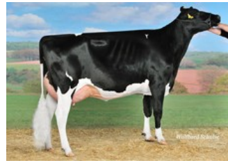
Tirs vad Beacon Galaxy VG-85