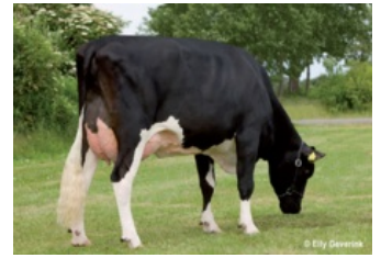
Tirs vad Juwel Ghana VG-88