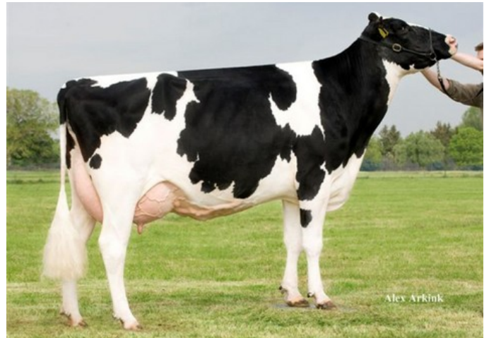
Holbra Pam VG-87

VG-86 Lucky PP-Red x GP-84 Fireman Red x GP-83 Aikman RDC x VG-85 Man-O-Man x VG-87 Mascol x VG-88 Durham x EX-90 Rudolph x EX-95 Chief Mark x EX-91 Sexation x EX-93 Elevation