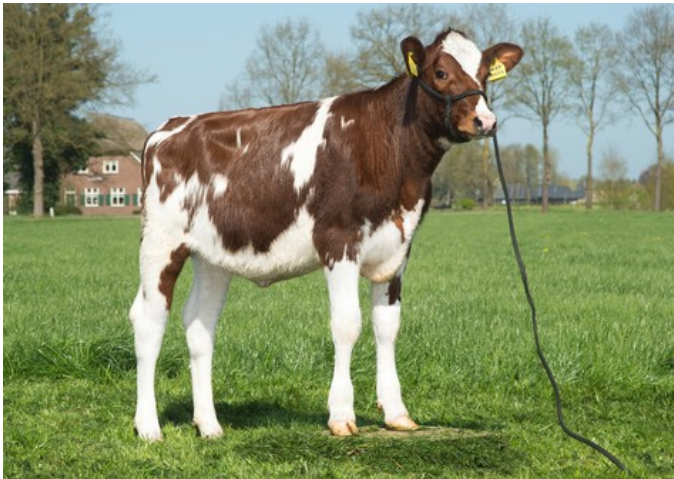
Oosterbrook Lucky Danick P Red VG-86