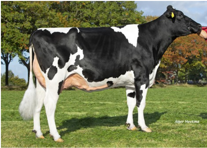
HET Adora Chanel VG-86