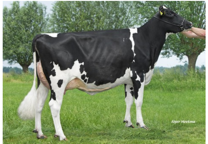
Wilder Kalibra RDC VG-88

VG-87 Styx Red x VG-88 Battlecry x EX-90 Brekem RDC x VG-88 Snowman x VG-89 Shottle x VG-88 Ramos x GP-84 Danube-Red