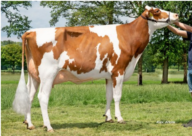
Kalibra SX 5631 Red VG-87