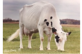
D-R-A August EX-96

GP-84 Styx Red x VG-87 Nugget RDC x VG-85 Supersire x EX-90 Superstition x EX-91 Goldwyn x EX-95 Durham x EX-93 Prelude x EX-94 Jubilant RF x EX-96 Marquis King x EX-90 Brutus