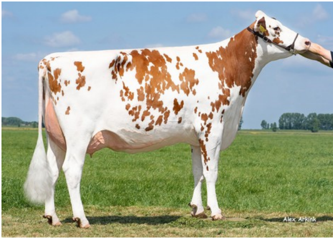
K&L RM Soraya Red VG-85