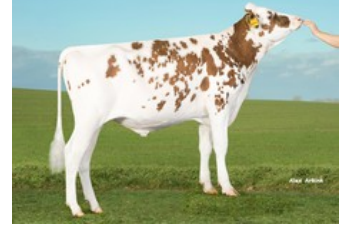
K&L RM Santorin

VG-85 Breaker RDC x VG-86 Brekem RDC x VG-87 Alchemy RDC x VG-85 Gerard x VG-87 Bolton x VG-87 Goldwyn x VG-87 Durham x VG-86 Formation x VG-88 Aerostar x EX Enhancer