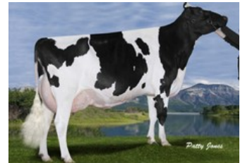
Gen-I-Beq Goldwyn Secret RC VG-87