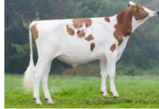
K&L RM Barone Rosso