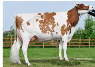
SPH Croteau Brekem Saga Red VG-86