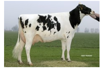
Koepon Shot Classy 17 VG-85