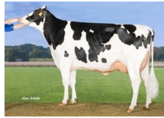
Koepon Oak Classy 4672 GP-83