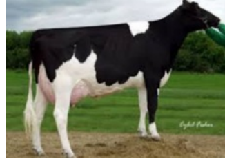
Orthoapple Marshall Alia VG-89