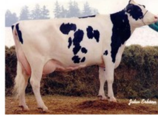
Clover-Mist Alisha EX-93