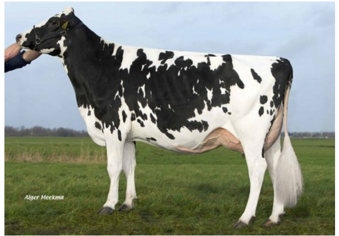
NH Super Islandwave EX-91

GP-80 Charley x VG-86 Balisto x VG-89 Mogul x EX-91 Superstition x VG-86 Shottle x EX-91 Juror Ford x VG-85 Cleo x VG-89 Aerostar x EX-92 Ugela Bell x EX-94 Ben