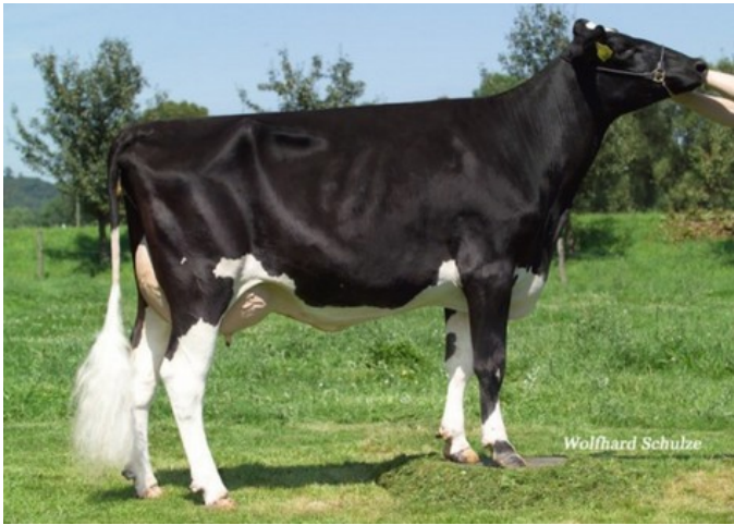
NH Shottle Island VG-86