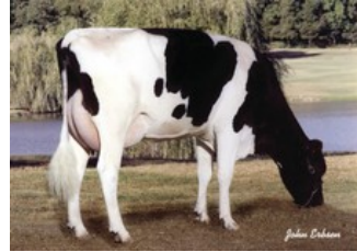
Regancrest-JB Tatum VG-87