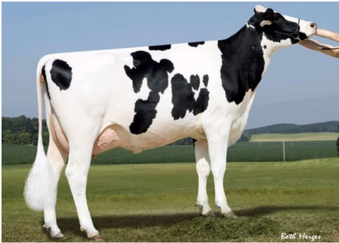
Sandy-Valley IO Amethyst VG-87