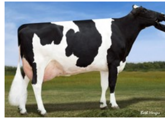
Sandy-Valley Bolt Sheila EX-92