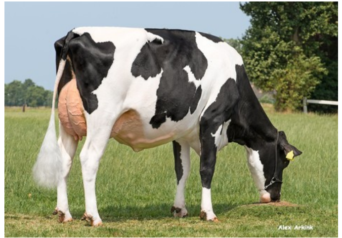
Holbra Malon 9 VG-88

VG-88 Board x VG-88 Balisto x VG-87 Man-O-Man x VG-87 Mascol x VG-88 Durham x EX-90 Rudolph x EX-95 Chief Mark x EX-91 Sexation x EX-93 Elevation x EX-94 Highmark