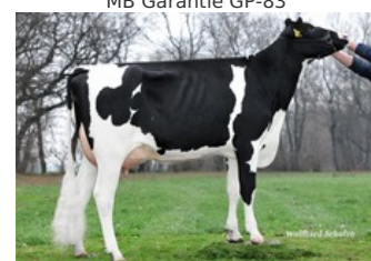
SHA Gerenuk EX-91

Comeback x GP-83 Beachboy x GP-83 Timberlake x Benz x VG-87 Rubicon x EX-91 Balisto x VG-87 Numero Uno x VG-87 Baxter x VG-86 Goldwyn x VG-88 Tugolo