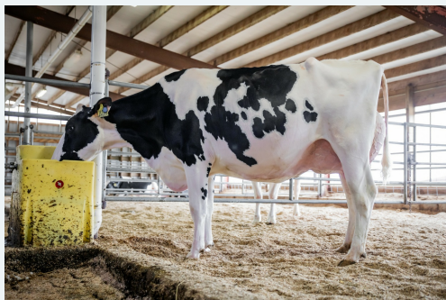
Dam to Hi-Note