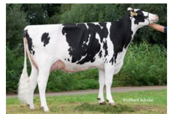
MB Garantie GP-83