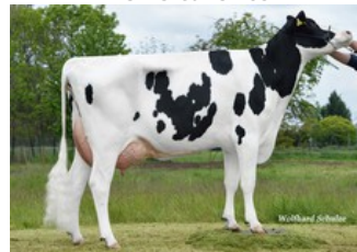
SHA Grumeti VG-87