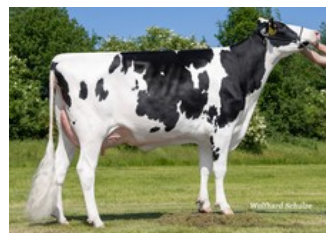
WSH Great GP-83