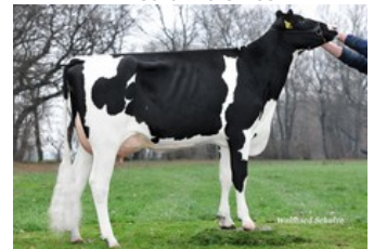
SHA Gerenuk EX-91

Comeback x GP-83 Beachboy x GP-83 Timberlake x Benz x VG-87 Rubicon x EX-91 Balisto x VG-87 Numero Uno x VG-87 Baxter x VG-86 Goldwyn x VG-88 Tugolo