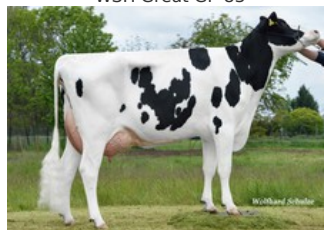
SHA Grumeti VG-87