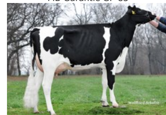
SHA Gerenuk EX-91

Comeback x GP-83 Beachboy x GP-83 Timberlake x Benz x VG-87 Rubicon x EX-91 Balisto x VG-87 Numero Uno x VG-87 Baxter x VG-86 Goldwyn x VG-88 Tugolo