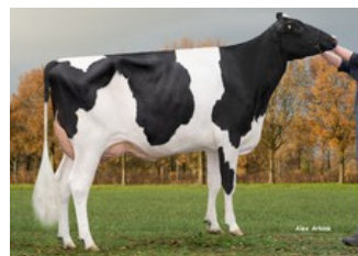
K&L OH Mabel