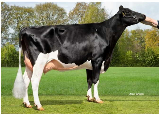
3STAR OH Maline

WKF REVO MALOU NL 943549787 DOB 07-07-2023