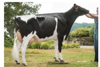
Maybelline Tual VG-85