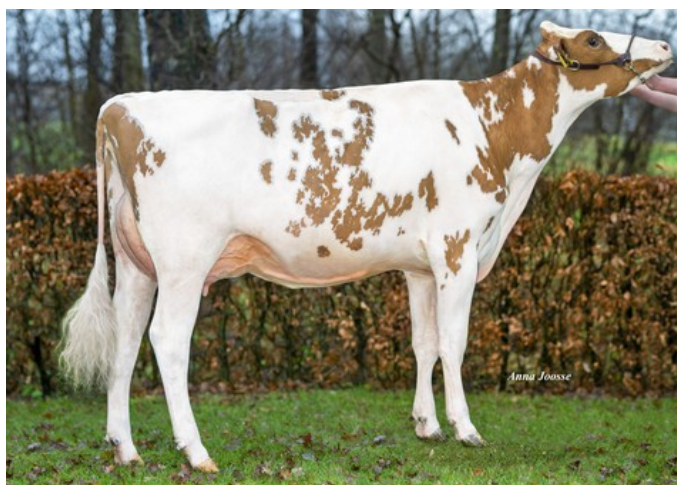
Schuit Solana P Red