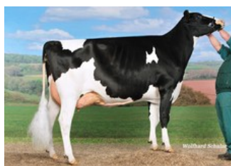
KNS Rendezvous VG-85