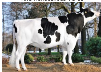
KNS Boss (v. Bookem)