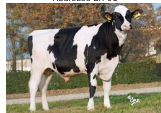
KNS Brasileiro (v. Balisto)

Cartoon P Red x VG-86 Solitaire P Red x Styx Red x GP-84 Silver x GP-84 Chevrolet x VG-85 Man-O-Man x VG-86 Goldwyn x EX-91 Jocko x VG-86 Labelle x VG-85 Oscar