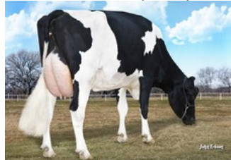
Morningview Super Roxy RDC EX-90