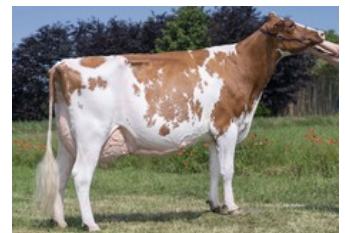
JK Eder Rocca Roxinne 1 Red EX-90