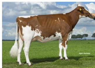
Rosie VG85, Alchemy x Roxy RDC