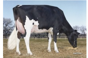
Morningview Pronto C-Rae EX-90

Amaretto-Red x EX-90 Apoll P Red x GP-84 Brekem RDC x Alchemy RDC x EX-90 Superstition x EX-90 Pronto x EX-93 Goldwyn x EX-90 Rubens RF x EX-90 Jubilant RF x EX-96 Tony