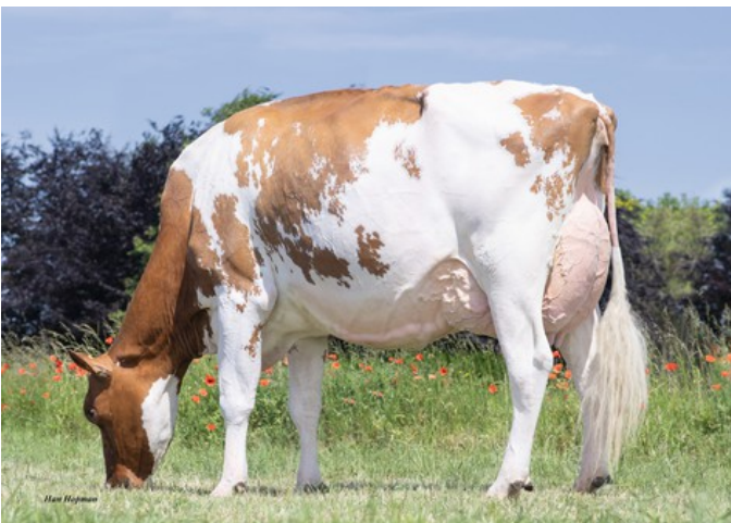
JK Eder Rocca Roxinne 1 Red

JK EDER ROCCA ROXINNE NL 574698766 DOB 27-03-2023