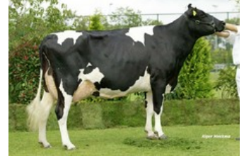
Willem's Hoeve Rita 233A EX-92

Mask Red x GP-82 Best Benz x GP-83 Gywer RDC x F-74 Mission P RDC x GP-83 Debutant x VG-87 Snow RF x GP-84 Jerudo x VG-87 Mr Burns RC x VG-88 Lightning RDC x VG-88 Marshall