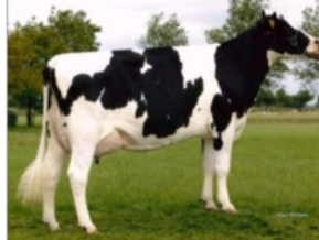
Willem's Hoeve Rita 282 VG-88