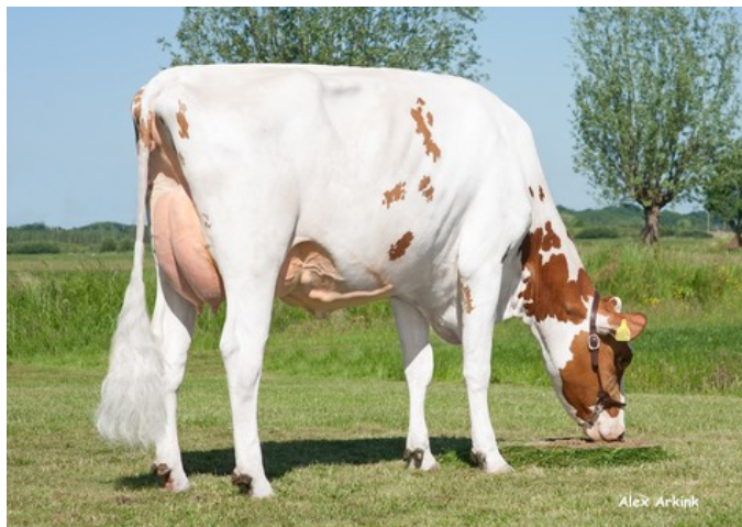
Poppe Red Hot Rita 860 Red