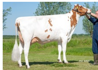
Poppe Red Hot Rita 860 Red VG-87