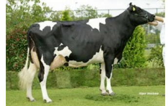
Willem's Hoeve Rita 233A EX-92

Mask Red x GP-82 Best Benz x GP-83 Gywer RDC x F-74 Mission P RDC x GP-83 Debutant x VG-87 Snow RF x GP-84 Jerudo x VG-87 Mr Burns RC x VG-88 Lightning RDC x VG-88 Marshall