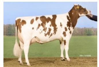
Willem's Hoeve Rita 0438 Red VG-87