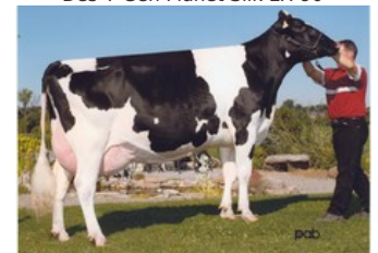
Gen-I-Beq Durham Sherry VG-87

Figaro x Star P RDC x Rubels-Red x GP-84 Salvatore Rc x Rubicon x GP-83 Cashcoin x VG-87 Snowman x EX-90 Planet x VG-85 Bolton x VG-87 Goldwyn