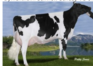
Gen-I-Beq Goldwyn Secret RC VG-87