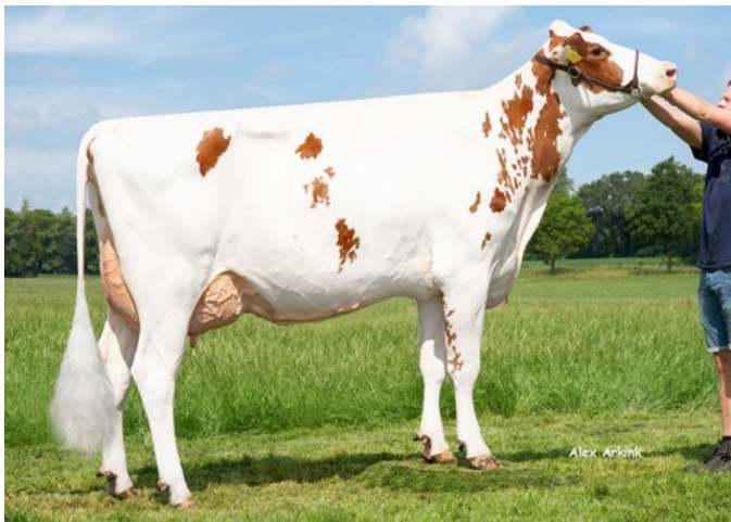
K&L SV Sunny Red