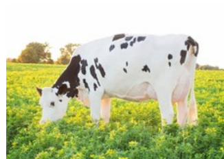
Dymenthalm Sunview Sunday VG-87