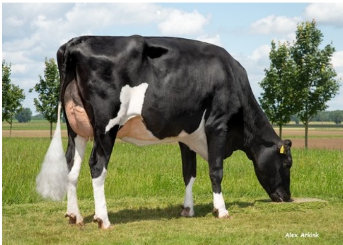
3STAR OH Mazzali

3STAR OH MAUDI NL 886110464 DOB 12-07-2023