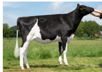
K&L OH Mallory