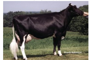
Tolare Rudolph Cupid, zus v Jimtown

Esquire x GP-84 AltaZazzle x Kenobi x Granite x VG-85 Rubicon x GP-84 Cashcoin x VG-86 Man-O-Man x VG-86 Shottle x GP-84 Finley x Brett