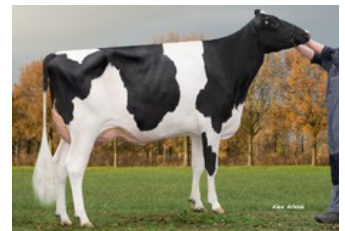
K&L OH Mabel