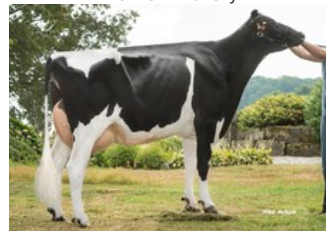
Maybelline Tual VG-85