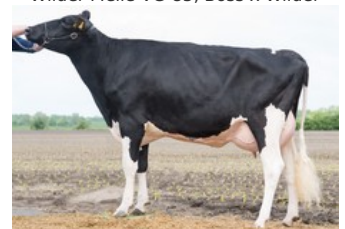
Wilder Meta VG-86

Cartoon P Red x VG-85 Broker PP x Hotspot P x VG-87 Mission P RDC x Penley x VG-86 Boss x VG-86 Shamrock x VG-87 Perform x EX-90 Goldwyn x VG-88 Morty