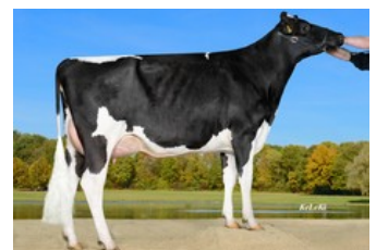
Wilder Melle VG-85, Boss x Wilder