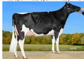
Wilder Meggy VG-86