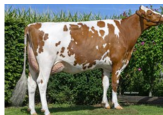
Miss Spark Red, Spark x Missy P RDC