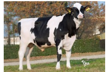
KNS Brasileiro (v. Balisto)

Cartoon P Red x VG-86 Solitaire P Red x Styx Red x GP-84 Silver x GP-84 Chevrolet x VG-85 Man-O-Man x VG-86 Goldwyn x EX-91 Jocko x VG-86 Labelle x VG-85 Oscar