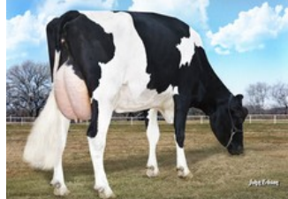
Morningview Super Roxy RDC EX-90