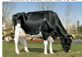
Kamps-Hollow Durham Altitude EX-95