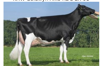
A-L-H Australia RDC VG-87

VG-86 Solitair P Red x Alaska Red x VG-85 Salsa RC x VG-87 Supersire x VG-85 Alexander x EX-91 Goldwyn x EX-95 Durham x EX-93 Prelude x EX-94 Jubilant RF x EX-96 Marquis King