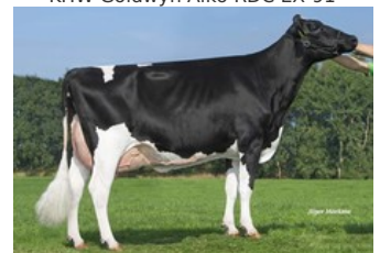
A-L-H Australia RDC VG-87

VG-86 Solitair P Red x Alaska Red x VG-85 Salsa RC x VG-87 Supersire x VG-85 Alexander x EX-91 Goldwyn x EX-95 Durham x EX-93 Prelude x EX-94 Jubilant RF x EX-96 Marquis King