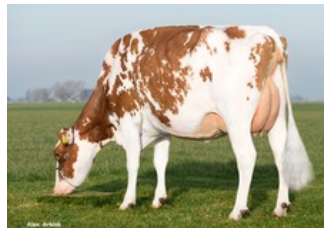
Batouwe Salsa Aiko Red VG-85