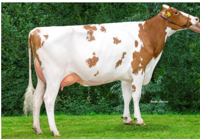
R&B Solitair Aisha P Red