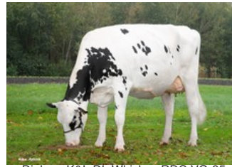
Diekers K&L DL Whiskey RDC VG-85