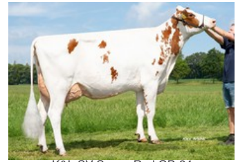
K&L SV Sunny Red GP-84