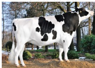
KNS Boss (v. Bookem)