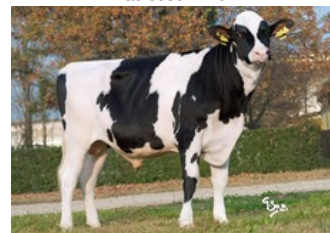
KNS Brasileiro (v. Balisto)

Cartoon P Red x VG-86 Solita P Red x Styx Red x GP-84 Silver x GP-84 Chevrolet x VG-85 Man-O-Man x VG-86 Goldwyn x EX-91 Jocko x VG-86 Labelle x VG-85 Oscar